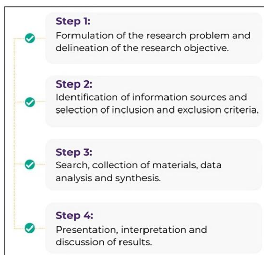
Figure 3. Research steps

We cataloged the found works, highlighting the authors, title, year of publication, nature (whether it is related only to pure mathematics or focused on teaching/education), the journal, and the online research site, in chronological order. The organization of the research is presented in Table 1 .