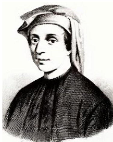
Figure 1. Leonardo Pisano (Fibonacci) (Silva, 2017, p. 3)

and there is no exact confirmation about the author of its creation in mathematical literature. With that said, we start from the following research question: What are the main characteristics of the research that has been developed around the Leonardo numbers and its sequence?