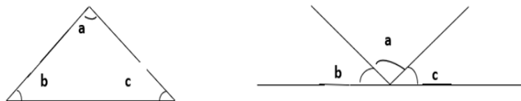
Figure 1. Cutting three angles